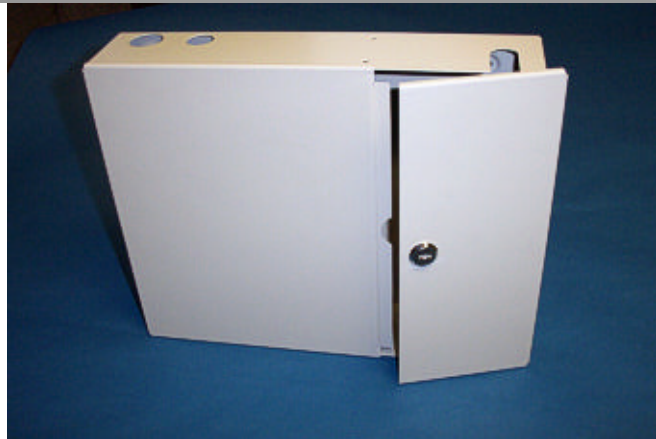
Data sheet Issue: 2

The Wall Mounted Enclosure is manufactured from mild steel and will provide secure termination and distribution for up to 24 fibres. Ideally suited to applications where space is at a premium and a rack is unavailable, this unit has the added security of a hinged lockable door.